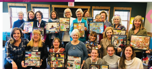
Beyond Our Borders today: More than 40 members make a difference for women globally.